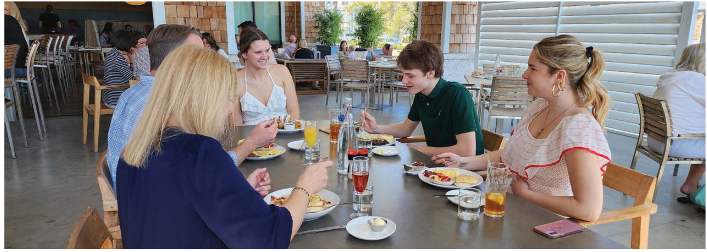
It's a family affair for the Sewards at Blue Surf Arboretum West, who are regular diners - in addition to their daughters holding part-time jobs there.